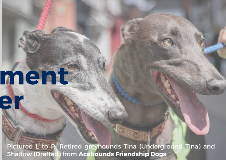
Pictured L to R: Retired greyhounds Tina (Underground Tina) and Shadow (Drafted) from Acehounds Friendship Dogs

HELPING GREYHOUNDS ENJOY LONG, HEALTHY AND HAPPY LIVES IN RETIREMENT